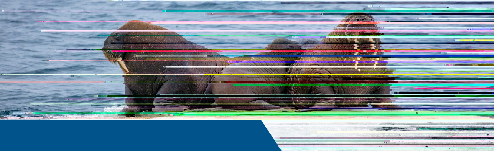
Walrus rest on sea ice in the Arctic.